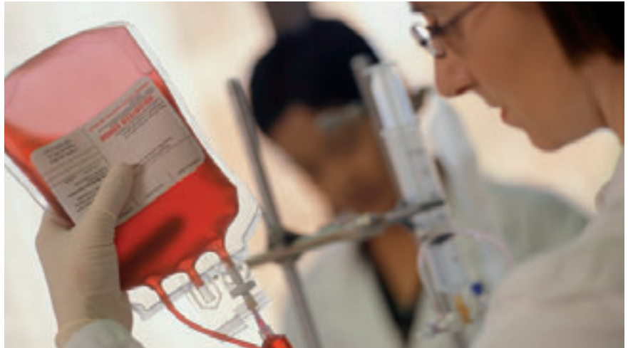
Ticona MT® grades comply with the demanding regulations of the medical technology market.

The US Food and Drug Administration (FDA) and European regulatory agencies specify very high requirements for engineering plastics used in medical applications. Biocompatible, especially tailored MT® polymer grades offered by Ticona meet the relevant approval criteria, are suitable for different sterilization methods and can therefore be used in the medical sector, e.g. for filter applications.