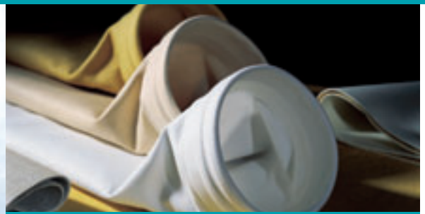
Due to excellent resistance, filter bags made of Fortron® PPS staple fibers are used for flue gas filtration in power plants.