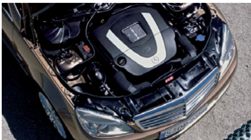
Elastomer hoses reinforced with high-tenacity Fortron® PPS multifilaments withstand the harsh environments under the hood.

In the new generation of hydraulic hoses for vehicle power steering systems and charge-air hoses for turbo diesel engines, high-tenacity multifilaments made from Fortron® PPS high-performance plastic are used to reinforce the elastomer hoses. Thanks to the reinforced layer made from PPS multifilaments, which combines high strength with good elongation under varying pressure loads, oscillations, vibrations and noise can be effectively reduced and driving comfort increased. In charged-air hoses, the Fortron® PPS reinforcing material provides the required operating strength at high turbocharger pressures and temperatures up to 200 °C, ensuring reliable and continuous engine performance.