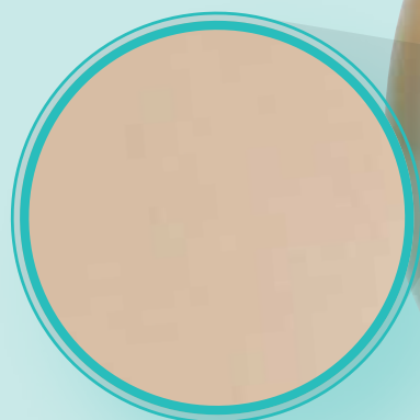
Illustration of homogeneous distribution of vitamin E

Compression molded parts made of GUR UHMW-PE vitamin E filled grades