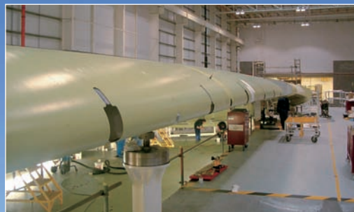
Production of the wing leading edge nose assemblies of the Airbus A380 at Stork Fokker in the Netherlands. The composite sheets are made from carbon fibers and Fortron® PPS from Ticona.