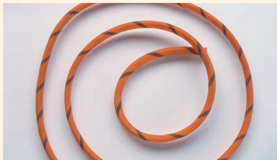
Braided cable sleeves made of Fortron® PPS are used in many applications in aircraft construction.

Specific properties of polyphenylene sulfide and its compounds: inherent flame retardancy, excellent hardness, stiffness and dimensional stability, high heat resistance with continuous service temperatures of up to 240 °C, very good chemical and oxidation resistance, minimal water absorption, good electrical properties, low creep and excellent mechanical properties.